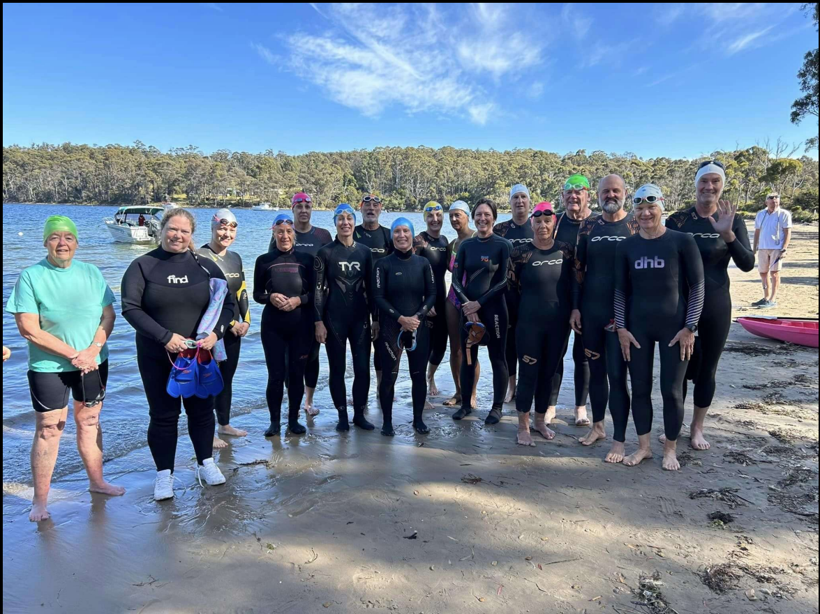
Some (but not all) of the swimmers about to enjoy the warm, clear water of Eggs & Bacon Bay