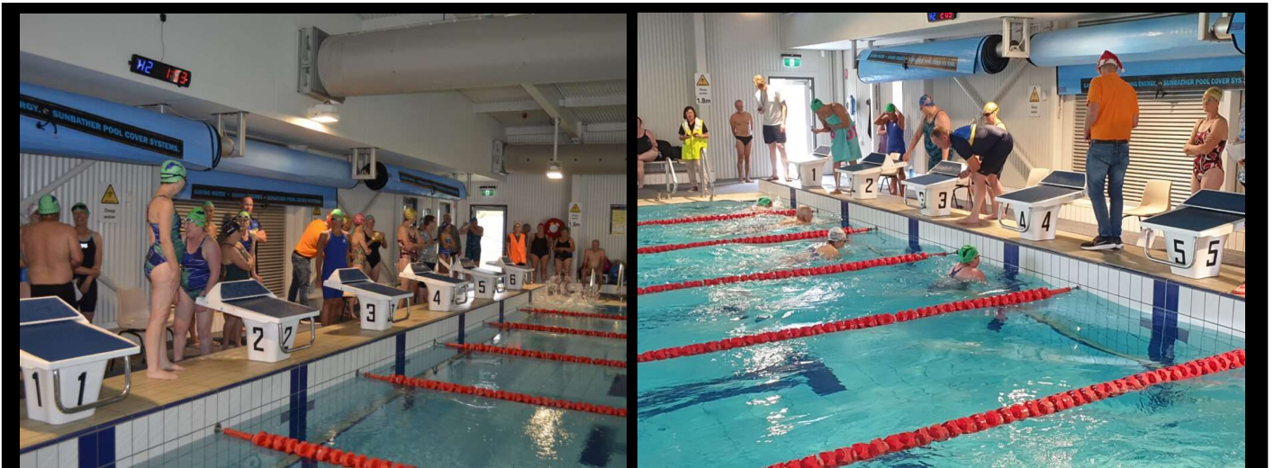
Plenty of Dolphins green caps at the start (L) and finish © of these races at Otlands in early December