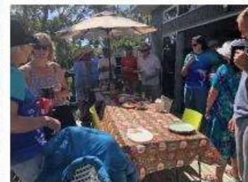
Scenes from last year's E&B Bay Swim.