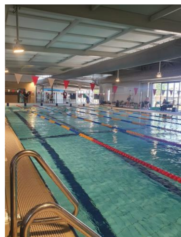
The beautiful Oatlands Aquatic Centre. Pop in and check it out next time you're passing through.