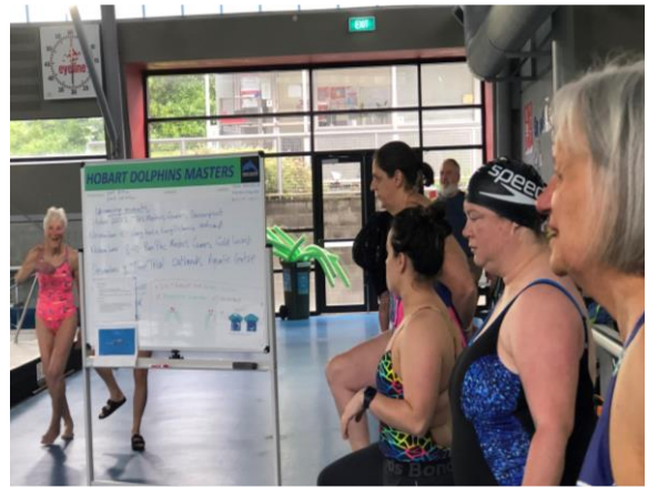
Anyone walking past is immediately aware of who those Dolphins are as they line up for a training session at 8am on Saturday mornings.