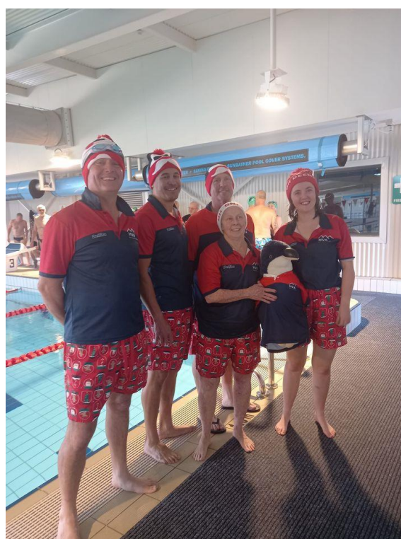
Huon Valley Aquatic - the best Christmas-themed club at the Oatlands Christmas Friendly Time Trial.

Masters Swimming Tasmania: P O Box 5229, Launceston 7250 Contact: >> mastersswimmingtasmania@gmail.com