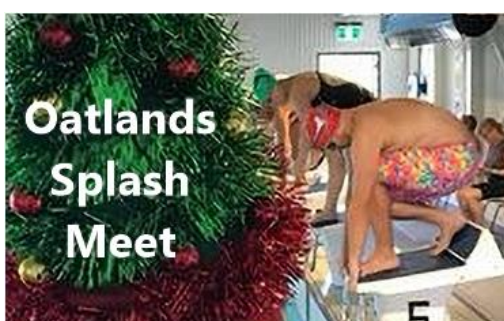
Who is that, under the Christmas tree hat?