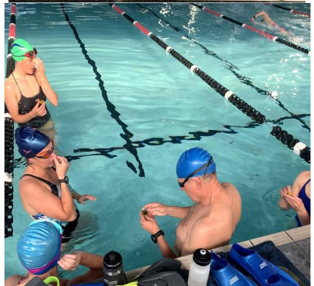
Dolphins setting the timers for a set of longer “CSS” (or maximum aerobic pace) swims

Editors’ Note: Thanks to everyone who contributed to this edition of Platypus Press. We would love to feature more stories about all the watery achievements and adventures taking place across Tasmania, so we want to hear from you! Have an idea, a fabulous photo, a story you want to share? Get in touch.