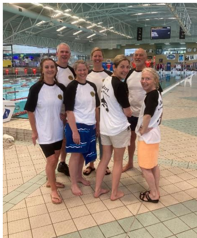
Hobart Aquatic members displaying their new T-shirts!

Members of Hobart Aquatic Masters Swimming Club were keen to display their new club t-shirts for the first time at the Long Course Long Distance meet in Hobart on 12 November. The t-shirts were partly funded by MSA's Just One More Grant program, which was established to help clubs support existing and new club members. All current members of the club are being provided with a new t-shirt at no cost to them to promote the club's focus on the team. Hobart Aquatic was able to offer the opportunity to acquire a new club t-shirt to attract some former members to re-join, such as those who had lapsed during the COVID period of reduced pool access. Hopefully the distinctive design that features an orca on the reverse will make an impression on potential new members as well, particularly those who are involved in open water swimming.