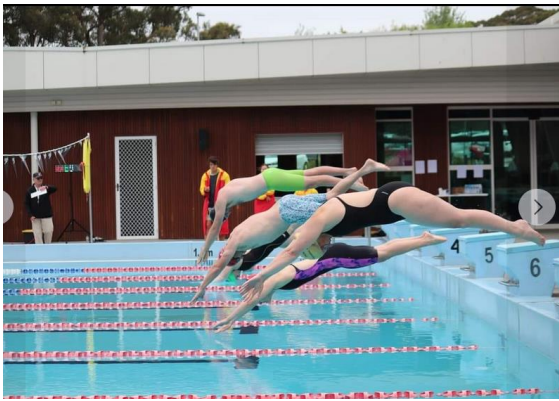
Taking off at the TMG in Devonport