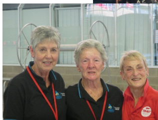
Some of the Technical Official from the Talays Club