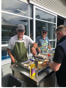
Breakfast at Clarence