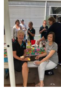
Breakfast at Clarence