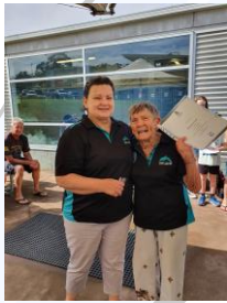
Breakfast at Clarence