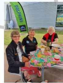
Breakfast at Clarence